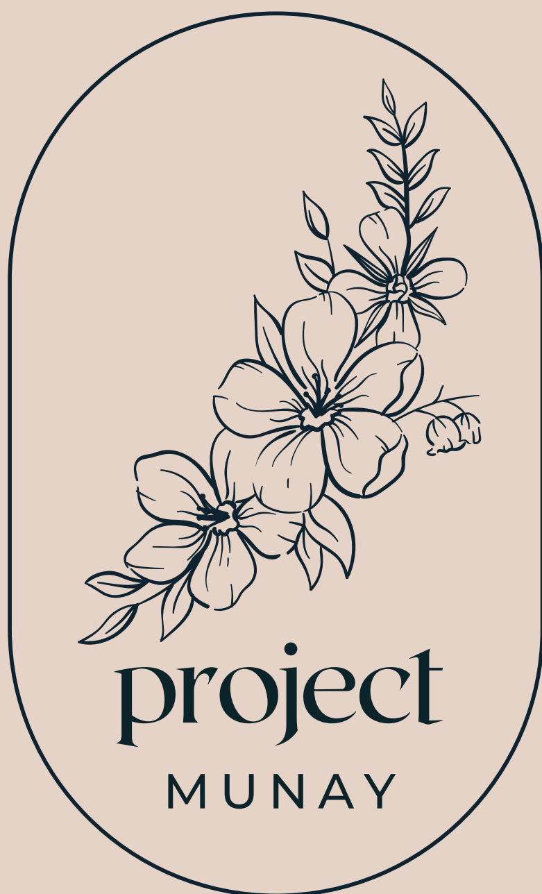
Fig. 2. Project Munay Official Logo Design Final Draft; Canva. (2020). Retrieved from canva.com

Last summer, I had the amazing opportunity of travelling to Peru. While I was there, I visited a rural Andean community, Ccaccacollo, where artisan women were selling handmade woven textile pieces to earn an income for their families. I was so inspired by their work and determination to break the cycle of poverty.