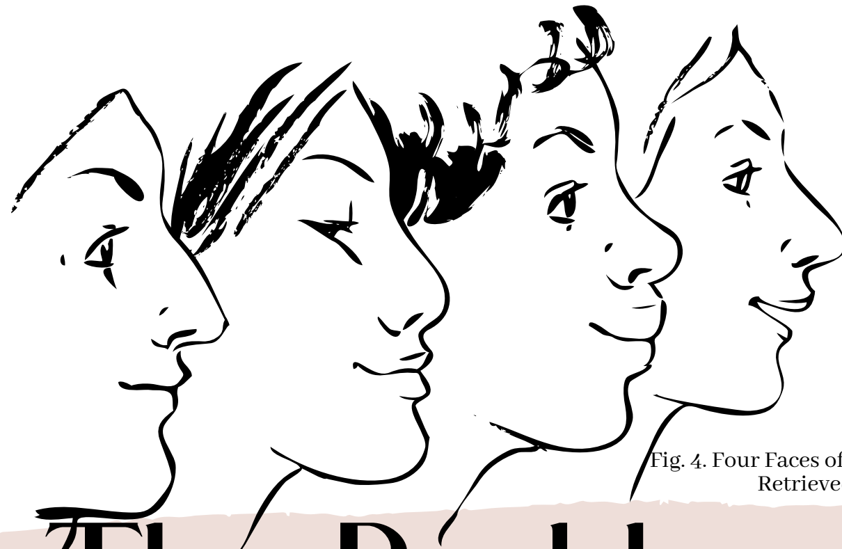
Fig. 4. Four Faces of Women Icon; Canva. (2020). Retrieved from canva.com