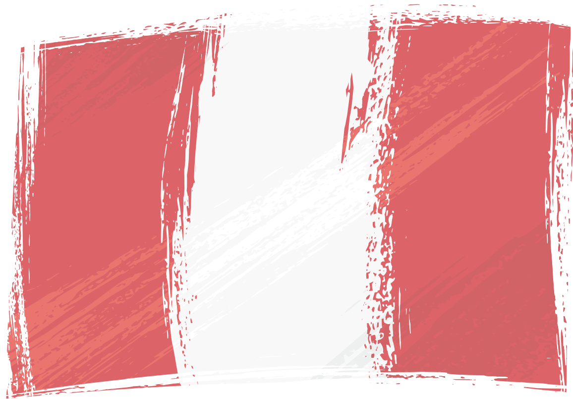
Fig. 6. Red and White Flag of Peru; Canva. (2020). Retrieved from canva.com