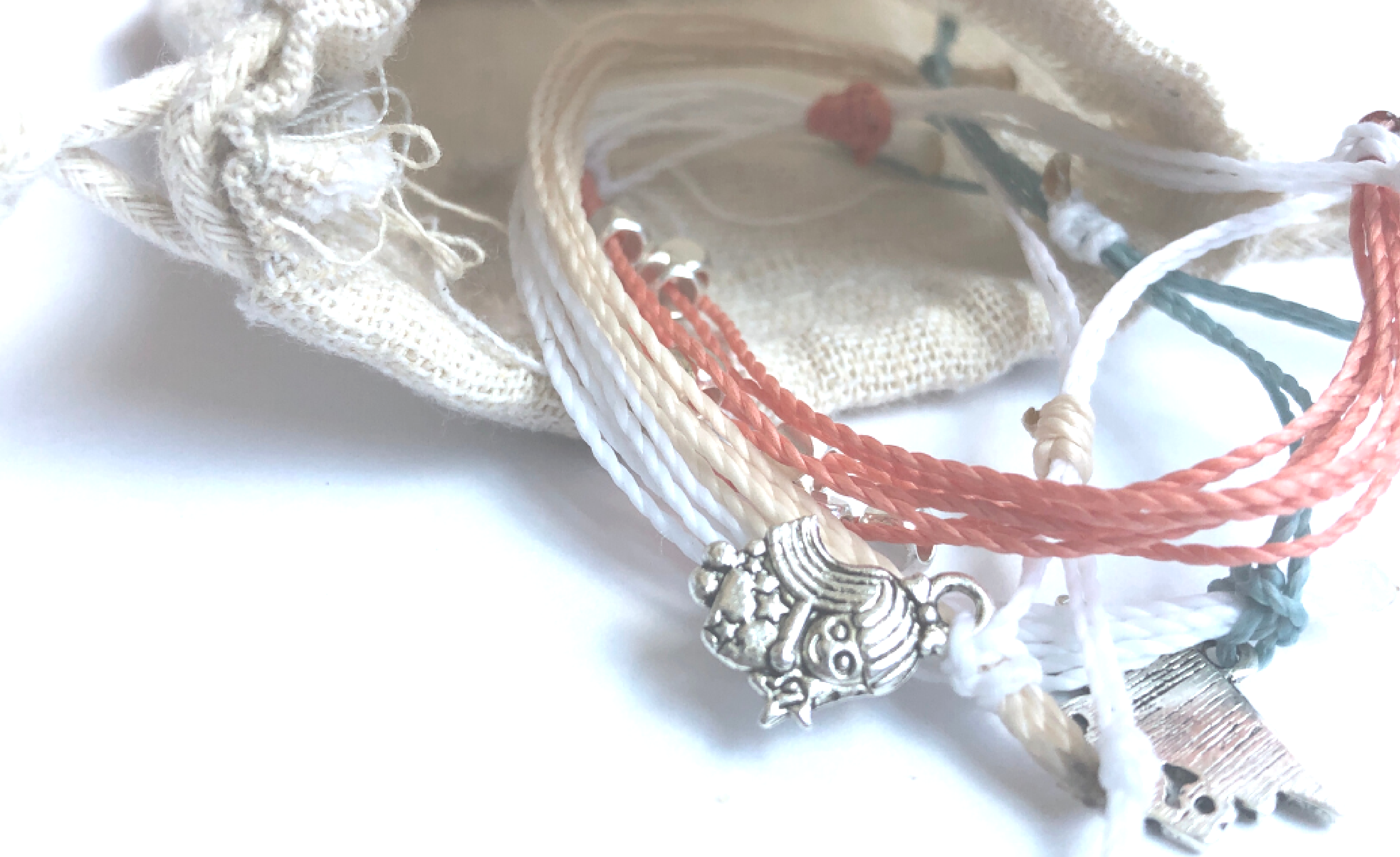
Fig. 14. Project Munay Bracelet and Anklets Photo Two; Photo of Jewelry Items [Personal photograph taken in Frisco, TX]. (2020, December 9).