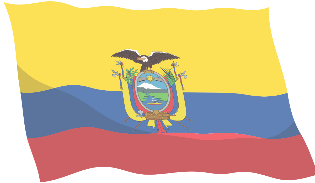
Fig. 5. Ecuador Flag Icon; Canva. (2020). Retrieved from canva.com