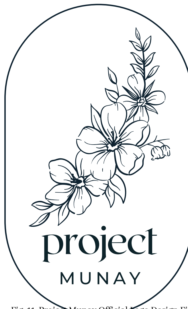
Fig. 11. Project Munay Official Logo Design Final Draft; Canva. (2020). Retrieved from canva.com