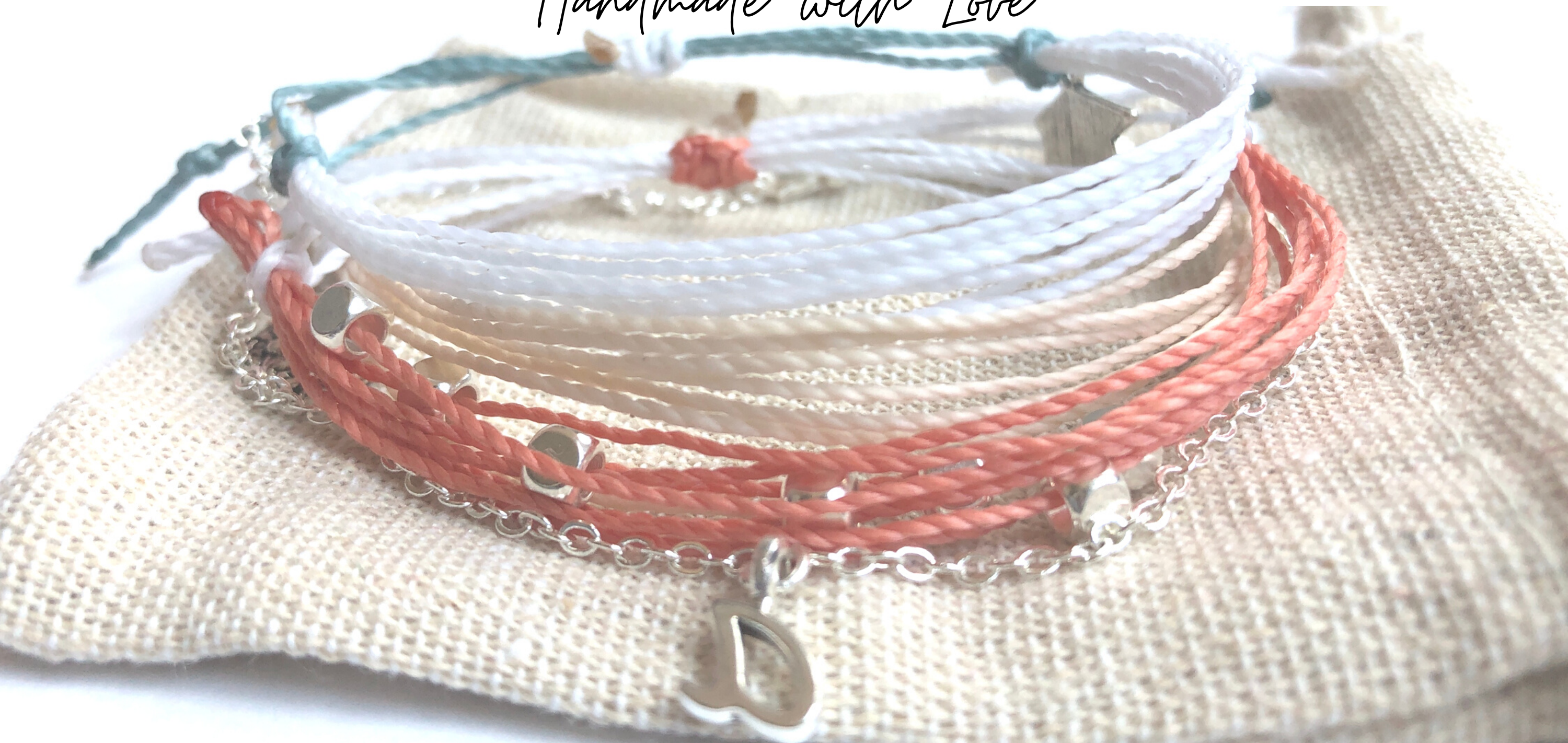
Fig. 12. Project Munay Bracelet and Anklets; Photo of Jewelry Items [Personal photograph taken in Frisco, TX]. (2020, December 9).