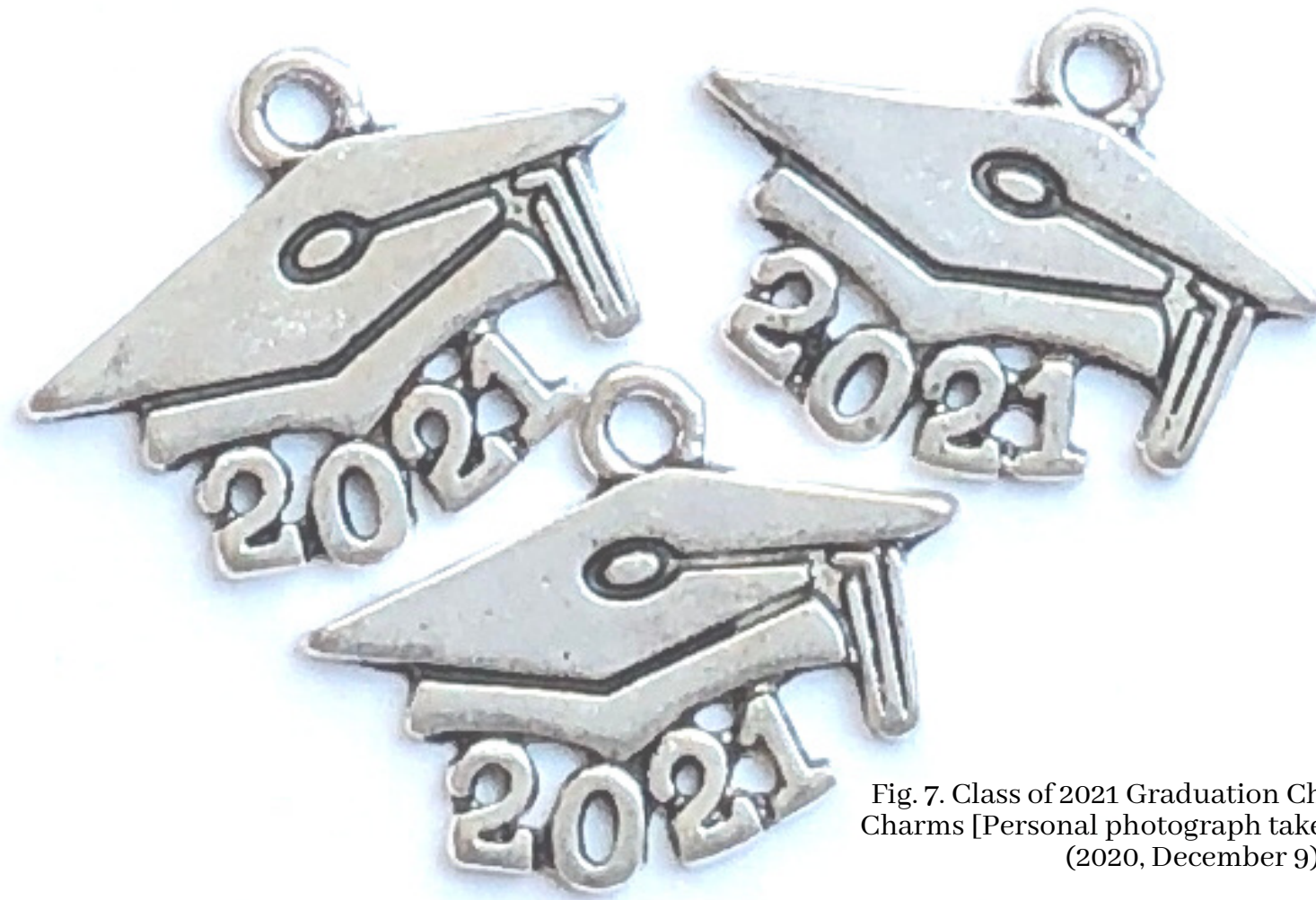
Fig. 7. Class of 2021 Graduation Charms; Photo of Charms [Personal photograph taken in Frisco, TX]. (2020, December 9).