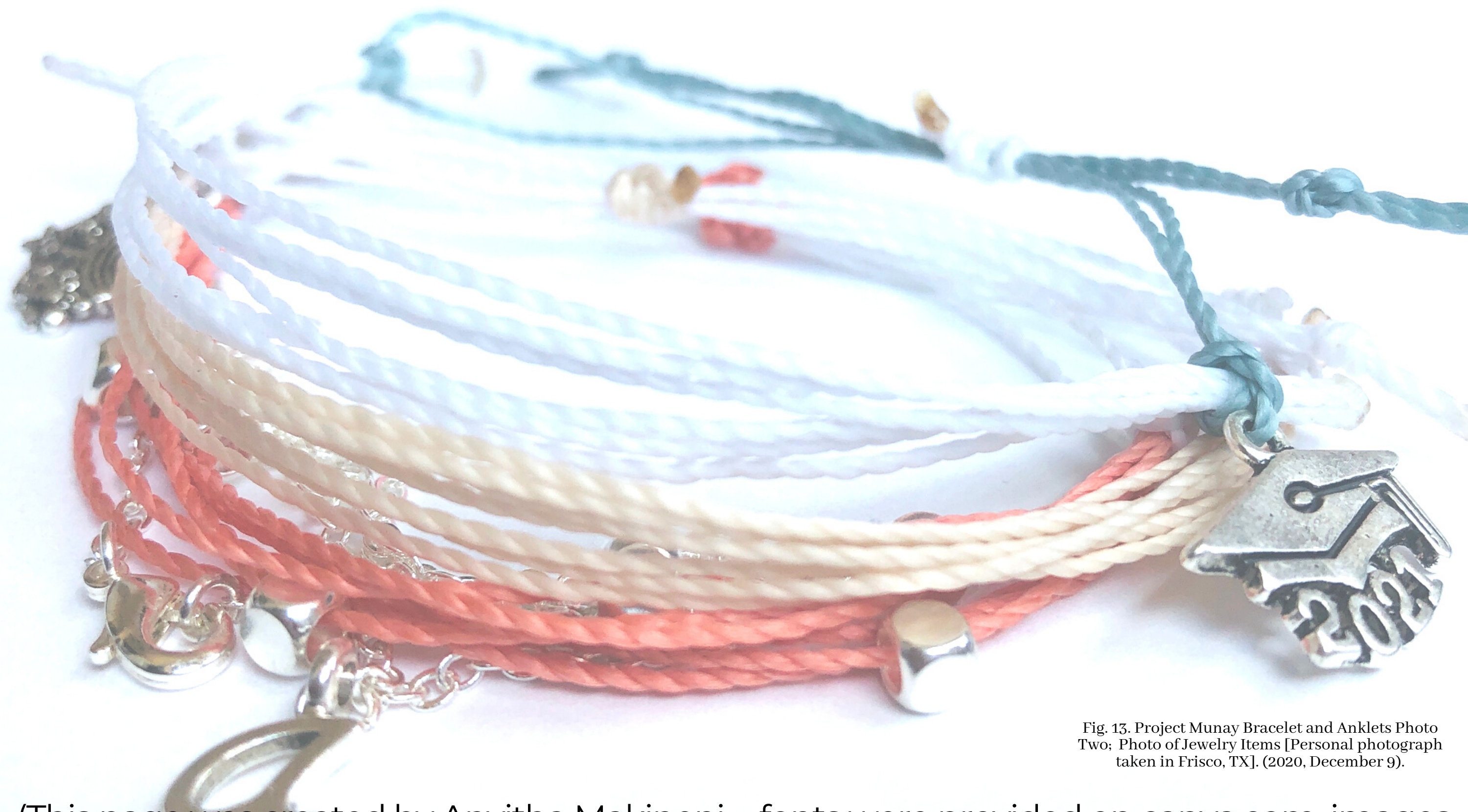
Fig. 13. Project Munay Bracelet and Anklets Photo Two; Photo of Jewelry Items [Personal photograph taken in Frisco, TX]. (2020, December 9).